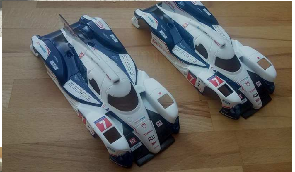
PQ1 & PQ2