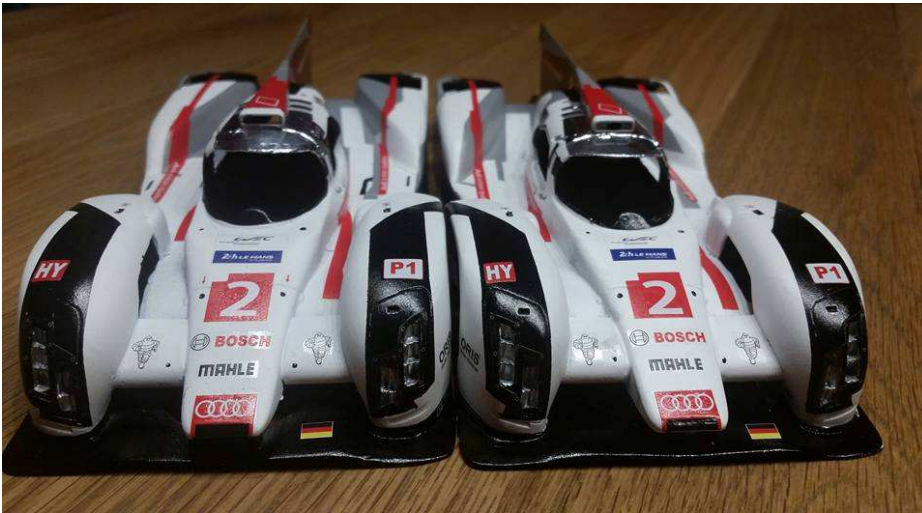
Hobby 2000 by D&G