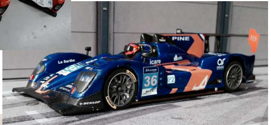
HoBS Racing Team