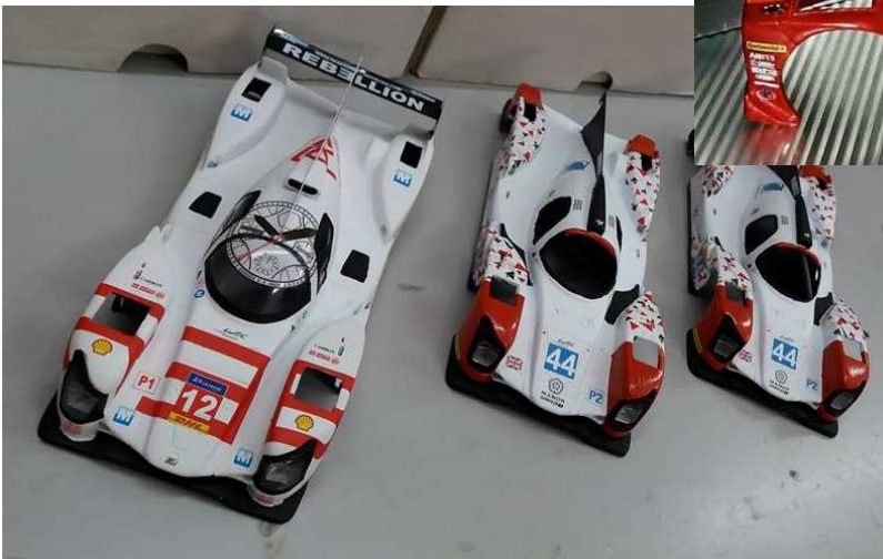
Jägerteam + Dr.Slot