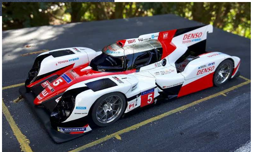
LRD International 1